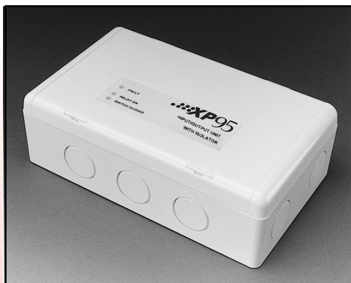
Part no 55000-847 (surface mount)

The control equipment transmits a 10-bit message to the Input/Output Unit: