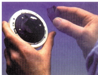
Removable chamber (Photoelectric smoke detector)

NB: Grade 1, Grade 2 and Range 1 as defined by BS5445 Part 5