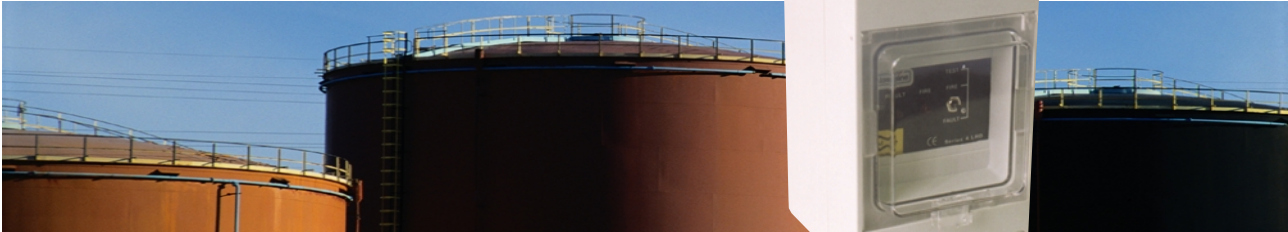
LHD 4 Controller